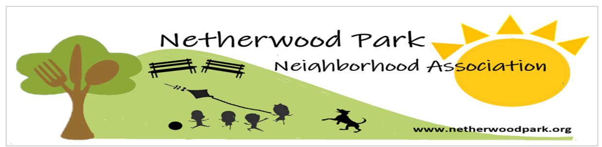
Miracerros Addition + Indian Plaza + Urban Forest Park & Netherwood Park